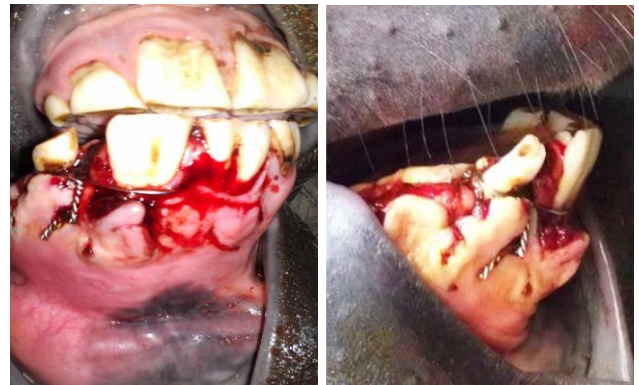
Fig. 2. Cerclage wire for rostral mandibular fracture in a 3-year-old Arabian colt.