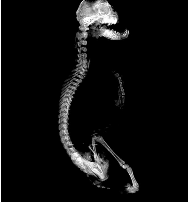
Fig. 5. Lateromedial radiograph shows superior brachygnathia, thoracic vertebra spinous process with more caudally oriented with no anticlinal vertebrae and a mild kyphosis.