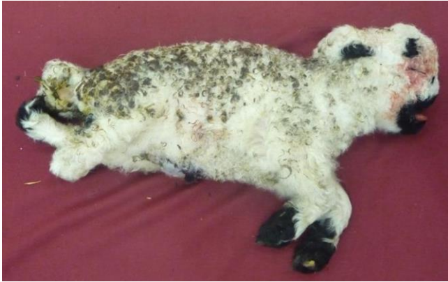
Fig. 1. Cross-breed white Kermanian lamb. Superior brachygnathia with a slight Roman nose is observed in the skull. Deformed limbs and mild kyphosis in the thoracic region are also seen.