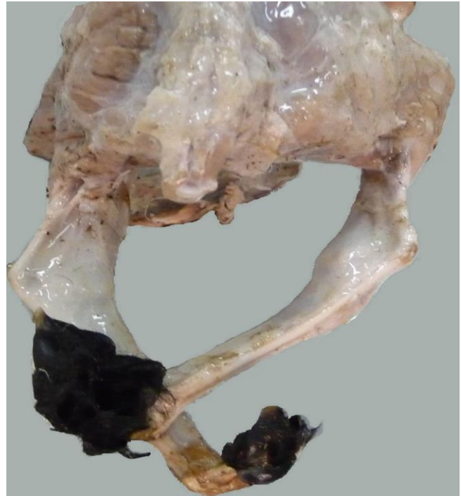
Fig. 3. Medial rotation in the tarsal joint that caused replacement of the calcaneus to the lateral side.

The assessment of the total length of the scapula, distal extremity of the humerus, distal extremity of the radius, total length of the ulna, proximal end of the metacarp, proximal extremity of the femur, total length of the tibia and metatars did not show any growth plate (Fig. 5). Radiographs of the tarsal joint showed the fusion of the calcaneus, talus and central tarsal bones. This fusion was also occurred in the distal row of tarsal bones (Fig. 6).