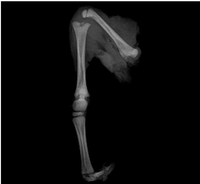
Fig. 6. Hind limb radiograph. Absence of growth plate in all bones is seen. The fusion of the calcaneus, talus and central tarsal bones are visible.