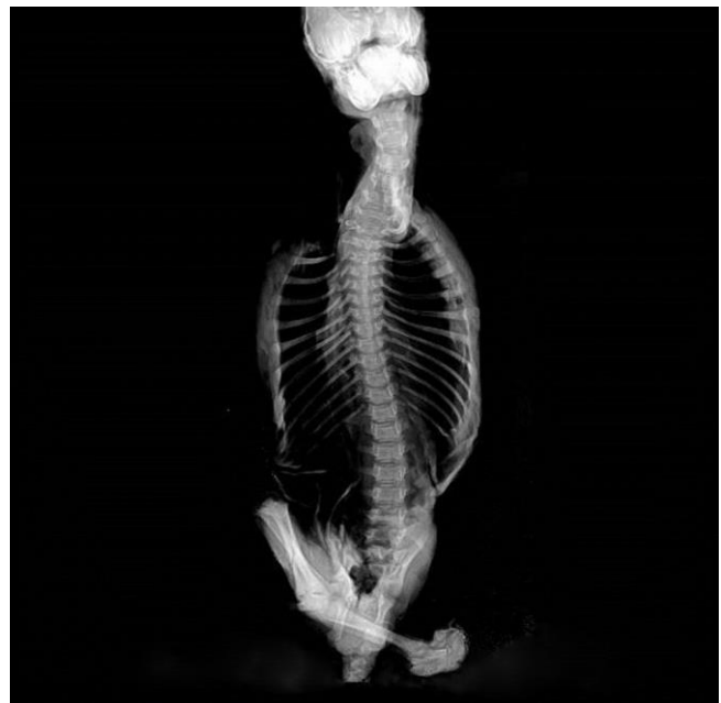
Fig. 4. Dorsoventral radiograph shows a scoliosis in the thoracic vertebrae region that continued to the lumbar region.