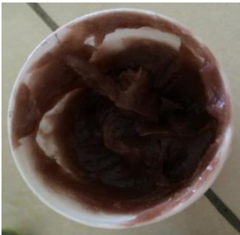
Fig. 2. Appearance of the produced ointment as the Guajol®.

Figure 3 represents the microscopic features in the H & E staining of burn wounds in each studied groups. Histological sections taken from the rats treated with 5.00%