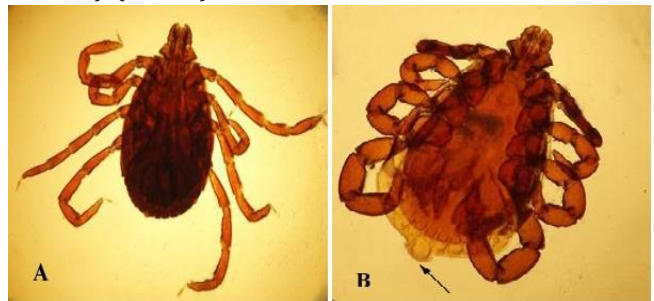
Fig. 1. A) Female of R. turanicus tick. B) Male R. turanicus , broad caudal appendage (Arrow), (25×).

A total number of 241 ticks (127 males and 114 females) were collected from hedgehogs. There were no differences in male and female ticks ( p > 0.05 ). Out of hedgehogs, 23 were infested with ticks (67.70%). All ticks were belonged to R. turanicus species (Fig. 1). Percentage of fed ticks on the body of hedgehogs was 72.20% (67 females and 107 males). Fleas of the species A. erinacei were found on 19 hedgehog of 34 (55.90%) examined hedgehog (Fig. 2). The number of infested fleas was 148 (42 males and 106 females), (Table1).