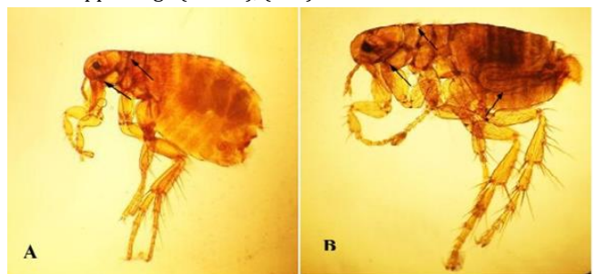
Fig. 2. A) Female hedgehog flea; A. erinacei , genal and pronotal ctenidia (Arrow). B) Male A. erinacei , genal and pronotal ctenidia and aedeagus organ (Arrow), (40×).