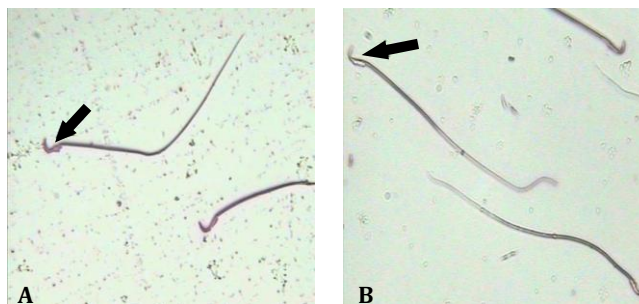
Fig. 1. Sperm viability in curcumin group; A) Dead sperm (red), B) Viable sperm (colorless), (Black arrows); (Eosin/nigrosin, 1000×).

Sperm Total antioxidant capacity (TAC). The TAC of sperm was significantly ( p < 0.05 ) preserved in curcumin group compared to that of the control (Table 1).