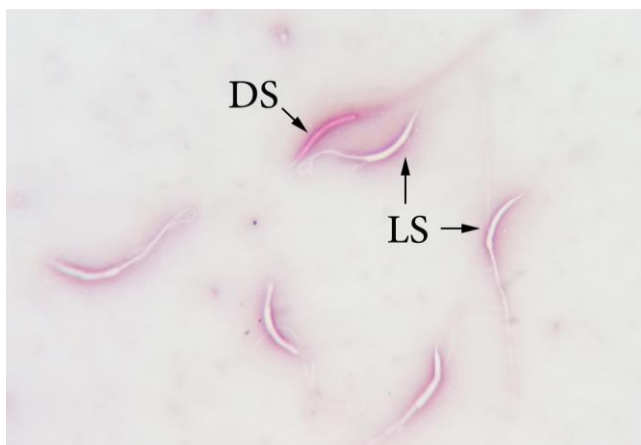
Fig. 2. Live and dead sperm cells. Dead sperm appeared to be pink (DS) and live sperms were not stained (LS) (eosin-nigrosin 1000×).

ab Different superscripts indicate significant difference in each row ( p < 0.05).