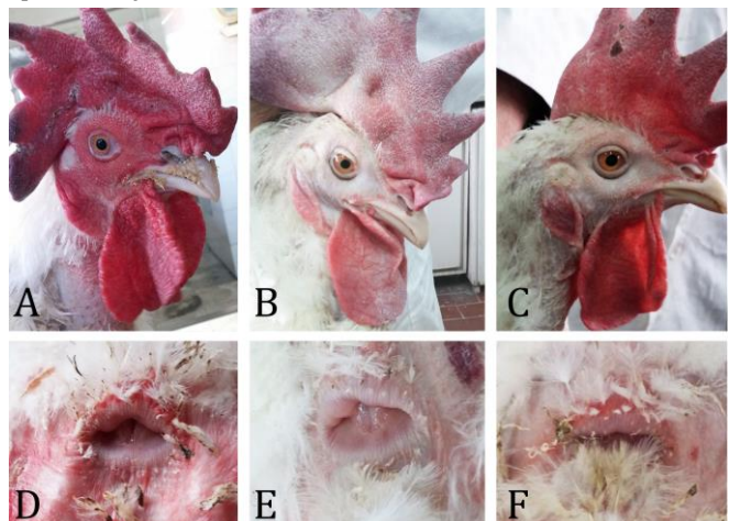
Fig. 1. Head and vent features in different groups of the examined roosters. A and D: head and vent of group 1 (fertile roosters), B and E: head and vent of group 2 (Sub-fertile roosters). C and F: head and vent of group 3 (roosters between groups 1 and 2).

Semen volume. Semen volume (mL) from each rooster using graduated centrifuge tubes was measured as previously described. 21