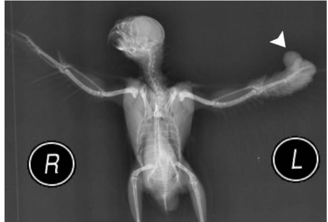
Fig. 2. A soft tissue mass (arrowhead) in the distal aspect of the left wing was observed in radiography.

37.00 °C for 24 to 48 hr. Bacterial isolates were identified as Klebsiella spp. based on colony's morphology, Gram staining and related biochemical tests. The presence of Klebsiella pneumoniae was confirmed with mPCR assay at genus and species levels, in which the 441 bp amplicon represented Klebsiella spp. and 108 bp amplicon indicated K. pneumoniae . The lack of 343 bp amplicon showed the absence of K. oxytoca comparing to controls. 12