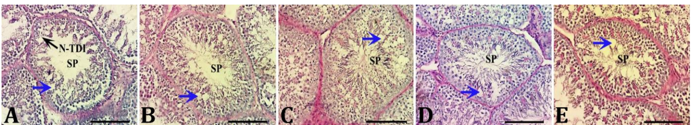
Fig. 2. Photomicrographs of testicular sections of the roosters (Cobb 500) ® belonged to A) Control, B) T1, C) T2, D) T3, and E) T4 groups. Testis of the control group exhibits degenerated seminiferous tubules with relatively inactive spermatogenesis and the presence of small amounts of sperm (SP) in the lumen. Also, TDI is negative in some parts of the control group seminiferous tubules (N-TDI). Testes of other groups show partial disorganizations along with vacuolation (blue arrows) in seminiferous tubules (PAS, Bar = 100 \mu m).

ab Different superscripts denote significant difference in each column ( p < 0.05 ).