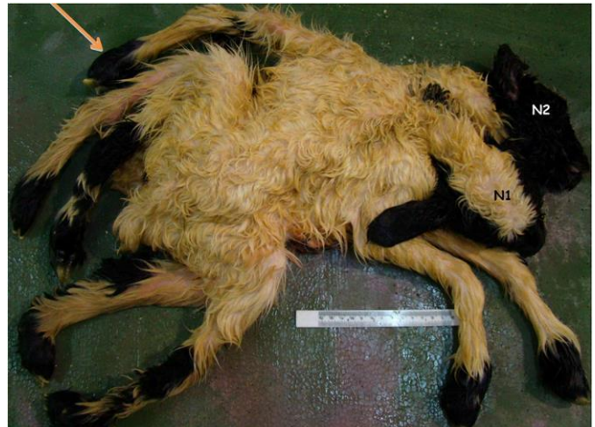
Fig. 2. External feature of conjoined twin lambs. Showing the notomelus (Arrow) and in N2 and over extension of the hind limbs in N1.