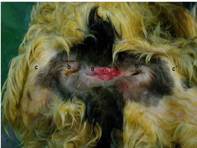
Fig. 4. Caudal aspect of the conjoined twin lambs showing two vulvas (a and a'), two anuses (b and b') and two fat tails (c and c').