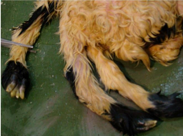
Fig. 3. The notomelus shows some digitations in the distal extremity.