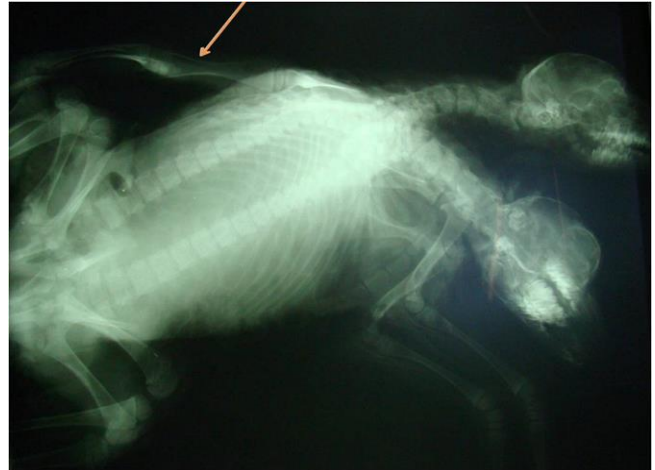
Fig. 1. The radiograph shows conjoined twin lambs having two vertebral columns (dispinous). Note the notomelus over N2 (Arrow).

Two separated alimentary tracts were seen in a common abdomen with only one spleen. There were two unequal livers holding one gall bladder. An uterus with its ovaries and also one urinary bladder were seen in N1. The bladder received four ureters from four kidneys. One diaphragm separated common thorax and abdominal cavities showing only one aortic hiatus but two esophageal hiatus, and two caval foramina.