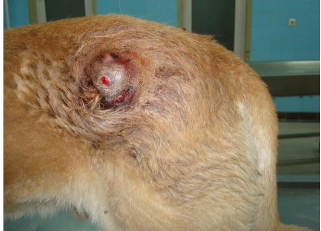
Fig. 1. Gross appearance of the subcutaneous mass. The skin over the neoplasm was alopecic and ulcerated.

A 2-year-old male Great Dane dog was evaluated for a cutaneous mass. This mass was located between the left flank and hip, raised in subcutis and it was approximately 5 cm in diameter. The skin over the neoplasm was alopecic and ulcerated (Fig. 1). Complete blood count, thoracic radiographs and popliteal lymph node size were normal. The mass was removed by excisional biopsy. The sample was fixed in 10% neutral buffered formalin and sections of the tumor were stained with hematoxylin and eosin (H&E) for histopathological evaluation. In addition, an immunohistological analysis was performed to differentiate the tumor from peripheral nerve sheath tumor and confirm the histopathological diagnosis. Immunohistochemical expression of vimentin and S-100 protein were used in formalin-fixed, paraffin-embedded sample and sections of 5- \mu m in thickness were processed with avidin-biotin-peroxidase complex (ABC) technique. Mayer's hematoxylin was used for counter staining.