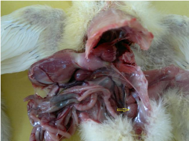
Fig. 2. Swelling (Arrow) and urates deposition in the kidneys of a broiler chicken with adenovirus-like inclusion body hepatitis.

Kidneys appeared swollen and pale (Fig. 2). On histopathological examinations, significant lesions were seen in the liver. Focal hepatitis with infiltration of mononuclear inflammatory cells was noted. Large eosinophilic intra-nuclear inclusion bodies were seen in hepatocytes (Fig. 3). Kidneys showed severe hyperemia, tubular epithelial cells degeneration, intra-tubular cellular cast formation, and mild interstitial nephritis. Mild focal myocarditis, with degenerated muscle fibers was seen in the heart sections.