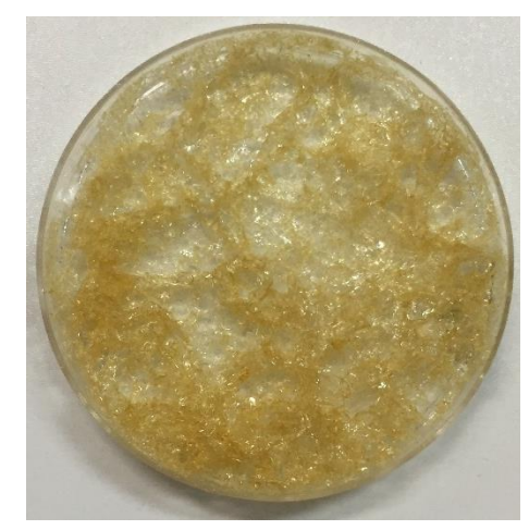
Fig. 1. The cell-free supernatant image of L. salivarius after lyophilization process.

Preparation of CFS from L. salivarius and L. acidophilus. The Ls-BU2 was originally isolated from buffalo raw milk and identified based on the 16S rRNA gene sequencing. The isolate showed promising antibacterial activity.<sup>17</sup> The L. salivarius was grown in MRS broth and incubated for 48 hr at 37.00 \pm 1.00 °C in a CO<sub>2</sub> incubator (Sina Lab., Tehran, Iran) and then the culture was centrifuged (Farzaneh Arman Co., Isfahan, Iran) at 4000 g for 10 min. The supernatant was removed, freezedried (Zist Farayand Tajhiz Sahand, Tabriz, Iran; freezing temperature: – 40 °C, pump pressure: 100 mTorr and shelf temperature: – 60 °C) and used as a CFS powder (CFS<sub>Ls</sub>; Fig. 1). The CFS of a well-known probiotic ( L. acidophilus LA-5; CFS<sub>La</sub>) was also prepared and used as a control in all experiments.