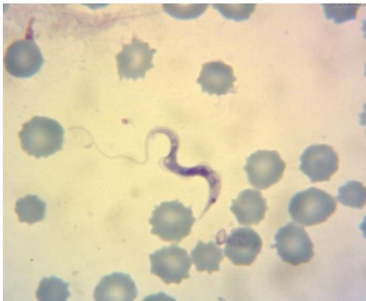
Fig. 1. Giemsa-stained blood smear showing large trypomastigote of Trypanosoma spp (100x)

Light microscopic examination of Giemsa-stained peripheral blood films revealed the presence of Trypanosoma spp. trypomastigotes (85.00 \pm 5.00 \mu m in length) freely scattered between erythrocytes having kinetoplast typically situated near the nucleus (Fig. 1). The PCR analysis showed an expected 289 bp fragment of the CATL gene of T. theileri amplified from a blood sample (Fig. 2). Negative control reactions of each PCR run did not yield amplification products. The PCR product was purified, sequenced, and registered under the accession number of MK393794 in GenBank. The sequences of the CATL gene of T. theileri obtained in the present study were compared with other CATL sequences retrieved from GenBank. Sequence analysis demonstrated the highest homology of 98.00-100% between obtained sequences and registered sequence of T. theileri in GenBank.