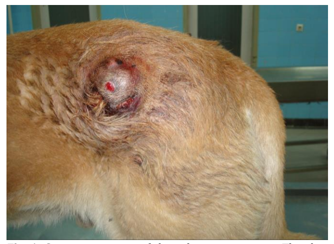
Fig. 1. Gross appearance of the subcutaneous mass. The skin over the neoplasm was alopecic and ulcerated.

A 2-year-old male Great Dane dog was evaluated for a cutaneous mass. This mass was located between the left flank and hip, raised in subcutis and it was approximately 5 cm in diameter. The skin over the neoplasm was alopecic and ulcerated (Fig. 1). Complete blood count, thoracic radiographs and popliteal lymph node size were normal. The mass was removed by excisional biopsy. The sample was fixed in 10% neutral buffered formalin and sections of the tumor were stained with hematoxylin and eosin (H&E) for histopathological evaluation. In addition, an immunohistological analysis was performed to differentiate the tumor from peripheral nerve sheath tumor and confirm the histopathological diagnosis. Immunohistochemical expression of vimentin and S-100 protein were used in formalin-fixed, paraffin-embedded sample and sections of 5-µm in thickness were processed with avidin-biotinperoxidase complex (ABC) technique. Mayer's hematoxylin was used for counter staining.