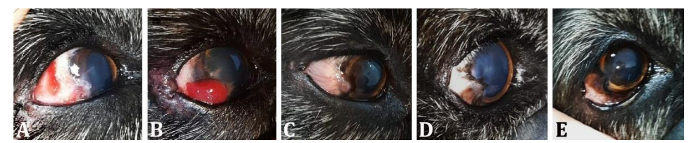
Fig. 3. A) Ten days after surgical treatment with adjuvant electrochemotherapy of the canine ocular melanoma. No signs of recurrence and presence of cicatricial granuloma are found; B) Presence of conjunctivalization 25 days after treatment. C) 45 days after the initial treatment of the canine ocular melanoma, there was a > 95.00% reduction in conjunctivalization and no signs of tumor recurrence were seen; D) 105 days after the initial treatment of the canine ocular melanoma, conjunctivalization was completely healed and there were no signs of inflammation or tumor recurrence. A slight peripheral corneal opacification was also observed. E) 215 days after the initial treatment of the corneal opacification was also observed.

The authors declare no conflict of interest.